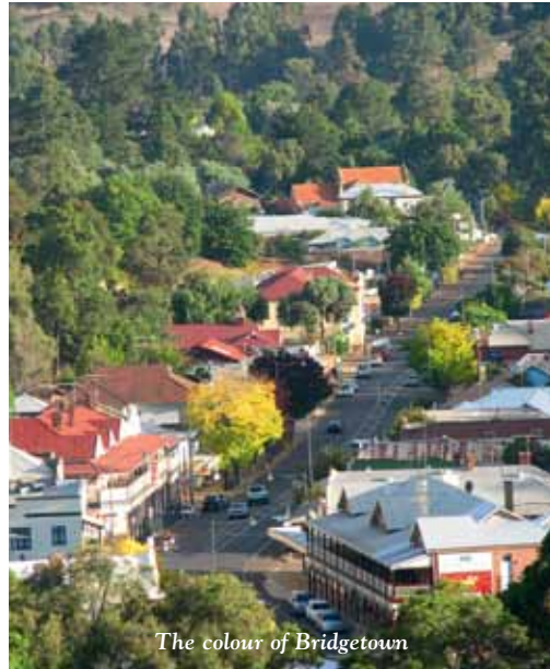
The colour of Bridgetown

Or Direct Debit to: BSB 806 036, Account number: 37314, Account name: Blackwood River Chamber Festival. Please also fill out this registration form and return it to the above address.