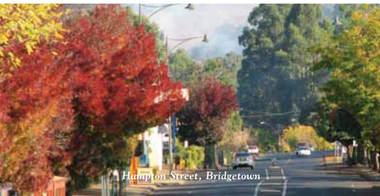
Hampton Street, Bridgetown

Telephone (08) 9761 2772 email: moletav@westnet.com.au